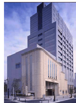
Crest Hotel at Kashiwa